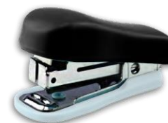
8244 Mini Stapler