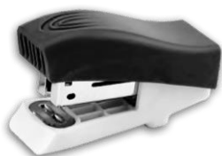
8227 Mini stapler