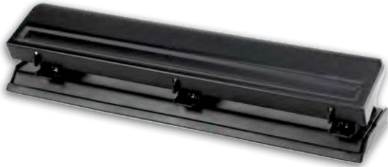
6305 Puncher 3 holes