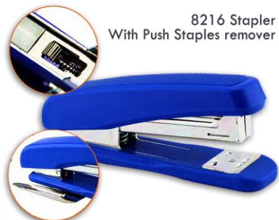
8216 Stapler With Push Staples remover