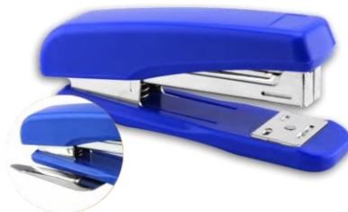
8215r Stapler With Staples remover