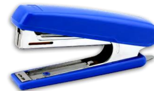
8209 Stapler With staples remover