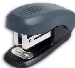
3202 Mini Stapler