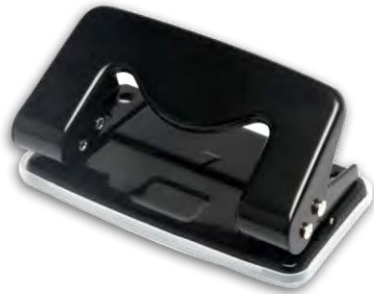
6304 Puncher 2 holes